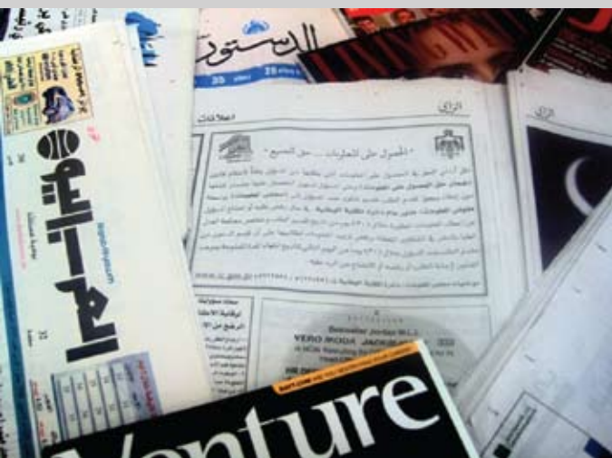
A government ad informs the Jordanian public of their right to information.

The code also provides for journalists' imprisonment, if they "defame any religion protected under the constitution", "offend the prophets", or "insult to religious sentiments and beliefs, fuelling sectarian strife or racism."