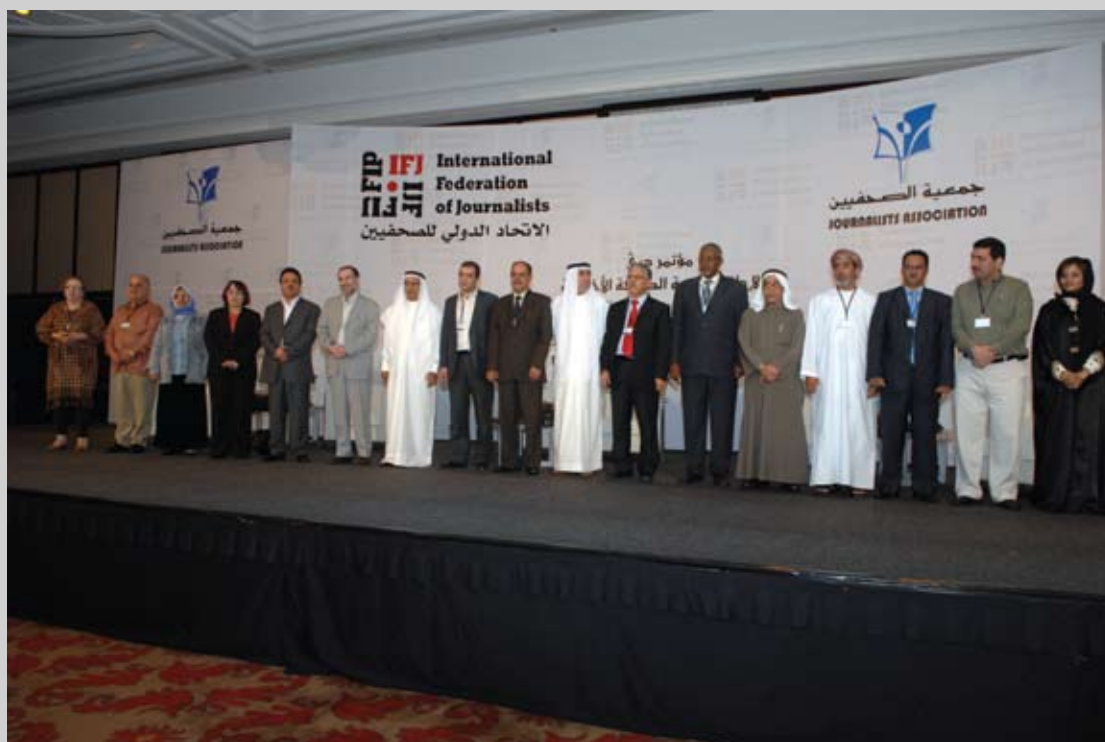
MENA IFJ affiliates, at the Ethical Journalism Initiative launch in Dubai, 9 February 2009.

In February 2009, the UAE-JA hosted in Dubai the launch of the IFJ-Ethical Journalism Initiative (EJI) in the MENA region. The EJI is a campaign that fosters ethics and higher quality journalism around the world. Journalists' unions, media organisations from the region, as well as specialists from the media community worldwide participated in this conference that focused on a range of issues including: Building Democracy through truth, independence and media responsibility, The Challenge of Pluralism and Diversity, Ethics in Times of