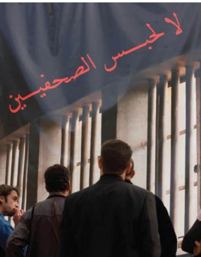
SNJ-Journalist Stand Up for Press Freedom on 5 November 2008, Algiers.

In 2001, the Penal Code (1990 law) was amended to increase sentences for press offences. Currently, offending religion through writing, cartoons, or speech can lead to five