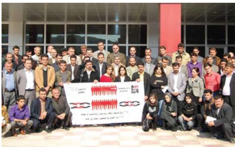
KJS Stand Up for Press Freedom on 5 November 2008, Erbil, Iraqi Kurdistan.

The meeting was used to further develop the national programme of work for the Iraqi Media Safety Group (IMSG), an organisation launched