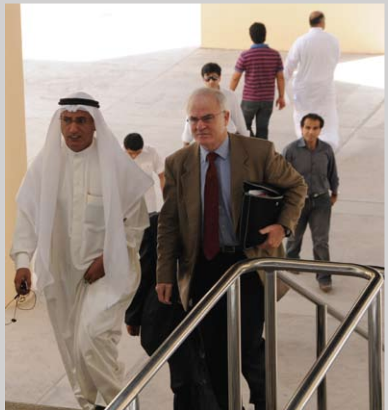
IFJ General Secretary, Aidan White, with BJA President, Isa Al-Shaiji, at Manama court, Bahrain, 30 June 2008.

In addition, the law allows fines of up to €6,000 for 14 other offences, including publishing information related to cases under investigation or being tried. Article 5 excludes electronic publications from the press law. Ar-