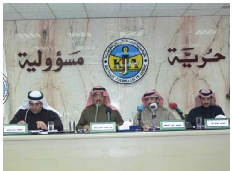
KJA meeting on 'Media's Responsibility in Covering Conflicts and Crises', 25 January 2009.

For further information visit KJA website: http://www.kja-kw.com