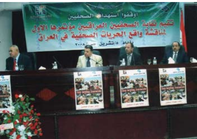
Meeting on Press Freedom held in Baghdad by the Iraqi Union of Journalists (IUJ), November 2008.

in 2007 by the IFJ, with the International News Safety Institute (INSI), IUJ and KJS. In December 2008, 45 men and women journalists working in Iraq and covering the conflict completed safety training courses in Baghdad. Attended by officials of the Iraqi President and Prime Minister cabinets, the meeting agreed to open a safety centre in Erbil.