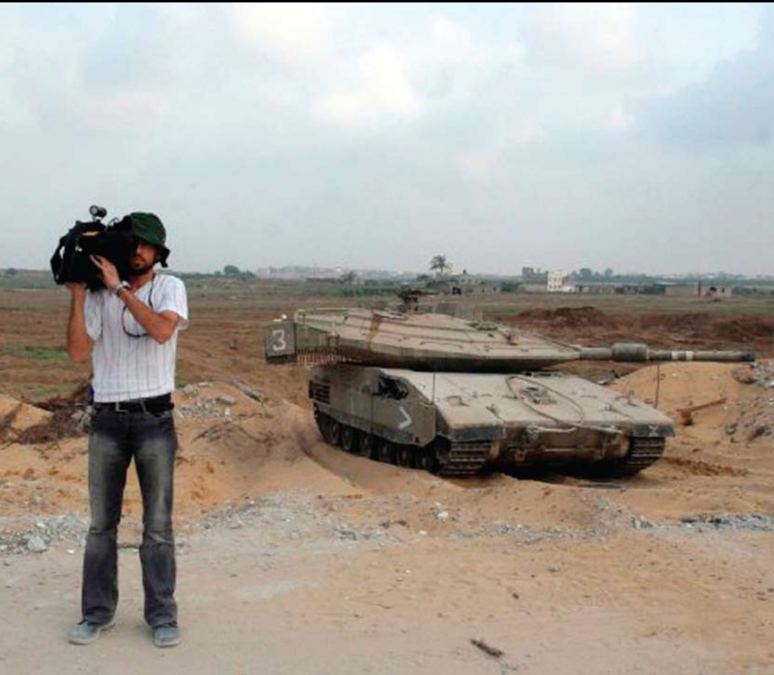
Reuters cameraman Fadel Shana is seen holding a camera next to an Israeli tank in the Gaza Strip. Shana, 23, and two other Palestinian civilians were killed on April 16, 2008, in what local residents said was an Israeli air strike in the Gaza Strip. © REUTERS/Handout (GAZA)