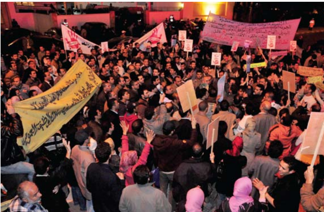
Demonstration organised by civil society organisations on 12 November 2008 -national day of journalism - in Rabat, denouncing government attacks against the press.

The 2002 Press Law and the 2003 Anti-Terrorism Law provide for financial penalties