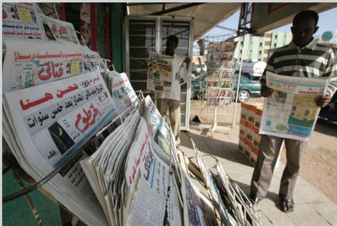
Sudanese men read news in the absence of ten political newspapers in Khartoum on November 18, 2008.

However, pressures on the media continued. In June 2008, security forces raided a Khartoum printing press and ordered the suppression of an entire page of Ajras